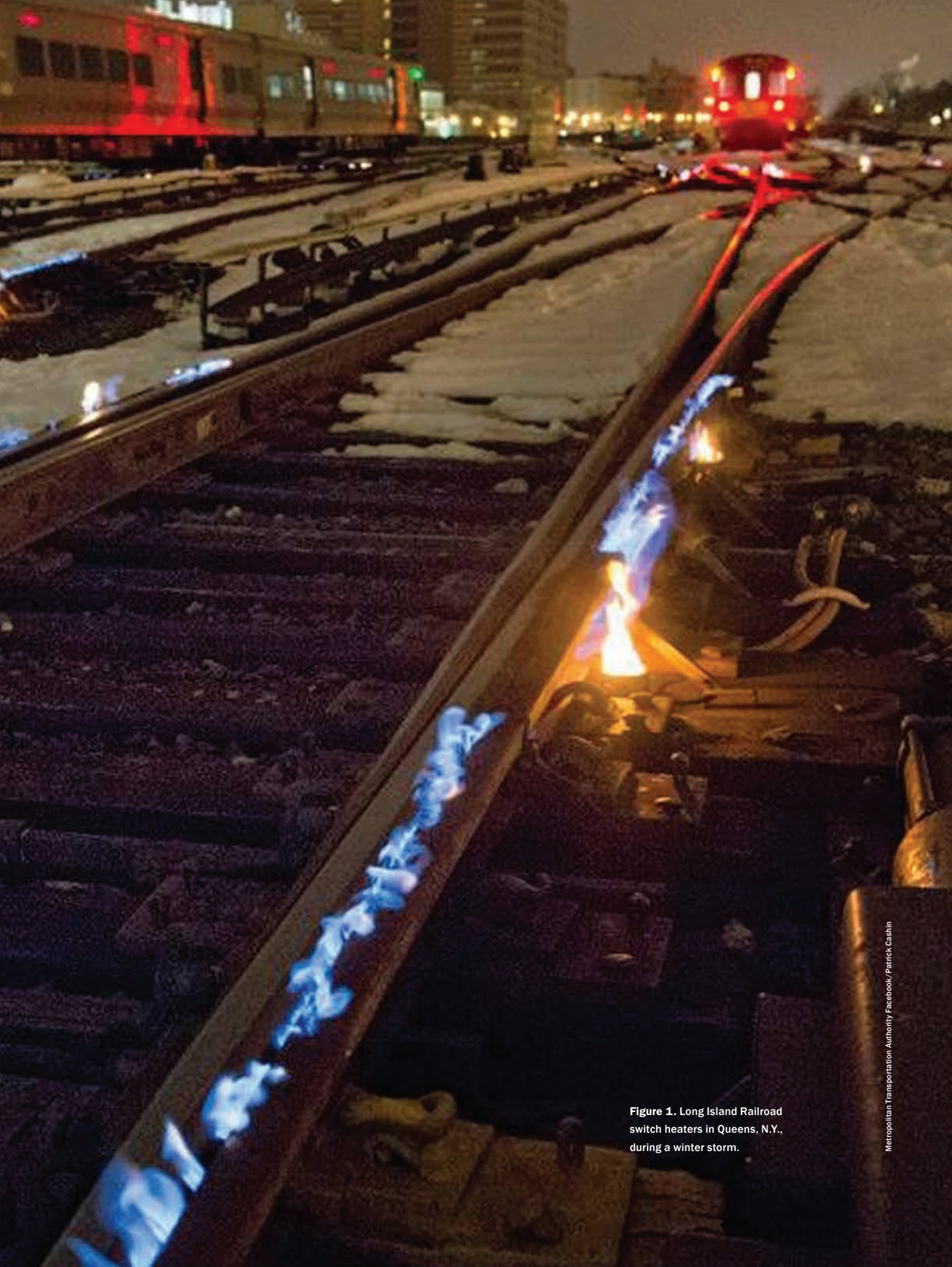
Figure 1. Long Island Railroad switch heaters in Queens, N.Y., during a winter storm.