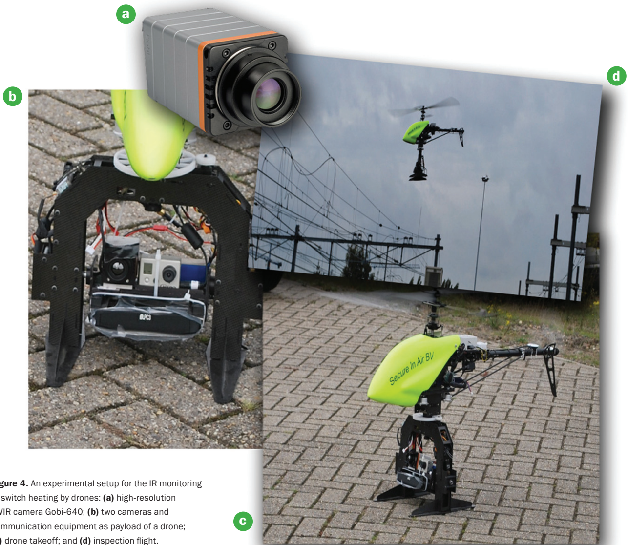
Figure 4. An experimental setup for the IR monitoring of switch heating by drones: (a) high-resolution LWIR camera Gobi-640; (b) two cameras and communication equipment as payload of a drone; (c) drone takeoff; and (d) inspection flight.

tion. Optionally available are thermography calibrations from 122 to 752 °F, 572 to 2192 °F, and up to 3632 °F for advanced industrial applications.