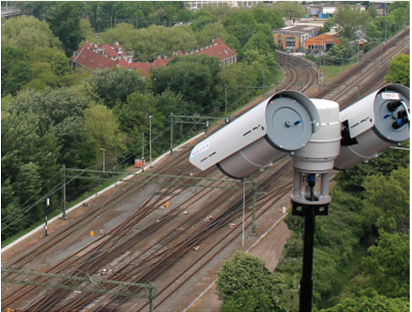
Figure 2. Dual-band image fusion on the PTZ platform GeoCamPro, which monitors switch heaters at a maximum range of 2000 ft.