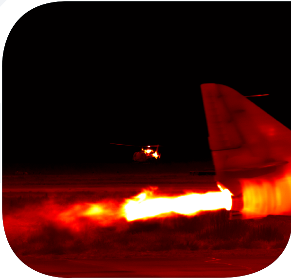
Jet engine IR signature measurement