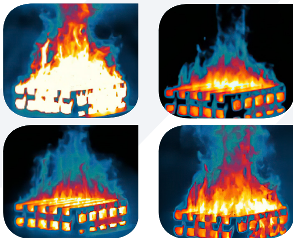
Multispectral image of burning wood crib