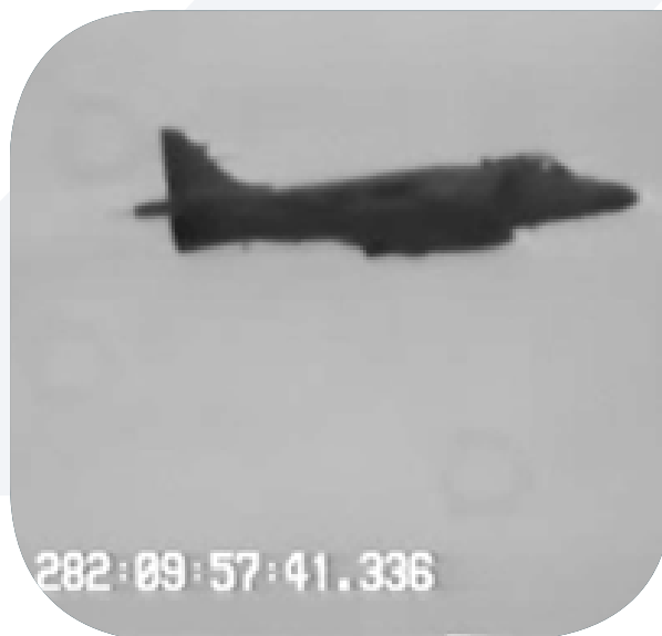
Side view of a fighter aircraft